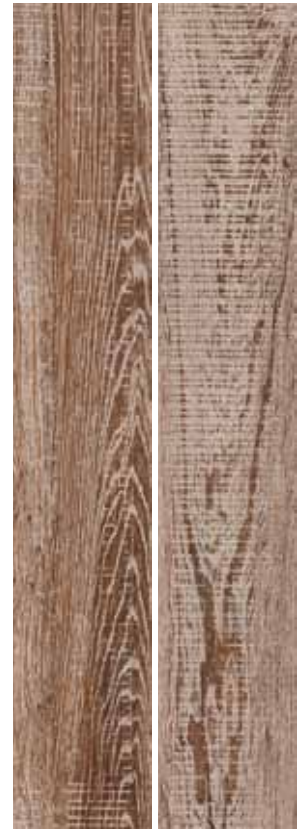
21CI09 • CI09 BROWN 8x48 in 20x120 cm