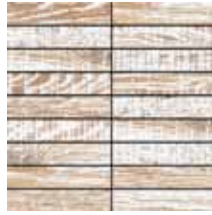
32CI01MO CI01 SUNSET MOSAIC 12x12 in 30x30 cm