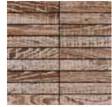
32CI09MO CI09 BROWN MOSAIC 12x12 in 30x30 cm