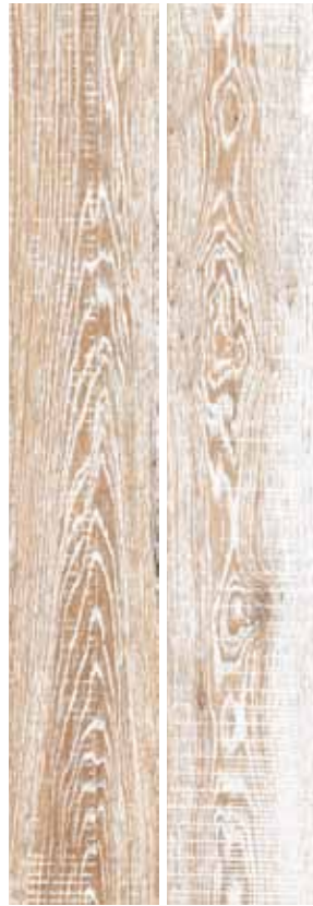
21CI01 • CI01 SUNSET 8x48 in 20x120 cm