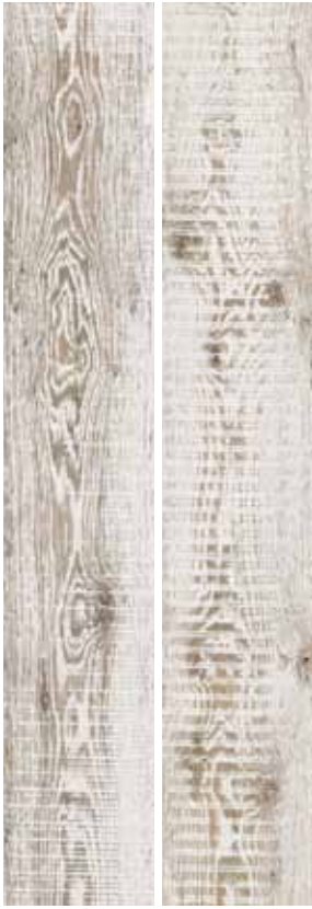
21CI07 • CI07 TAUPE 8x48 in 20x120 cm