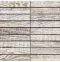
32CI07MO CI07 TAUPE MOSAIC 12x12 in 30x30 cm