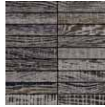
32CI08MO CI08 DARK GRAY MOSAIC 12x12 in 30x30 cm