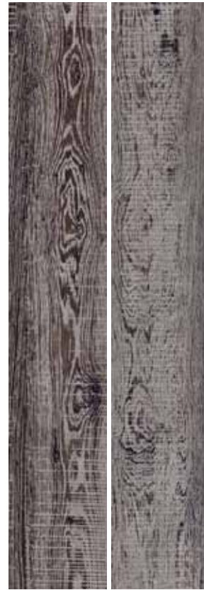
21CI08 • CI08 DARK GRAY 8x48 in 20x120 cm