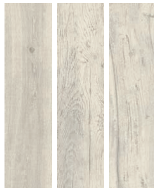
17LU10 Lumber LU10 Bianco 6"x24" . 15x60 cm