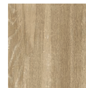
Lumber LU03 Honey