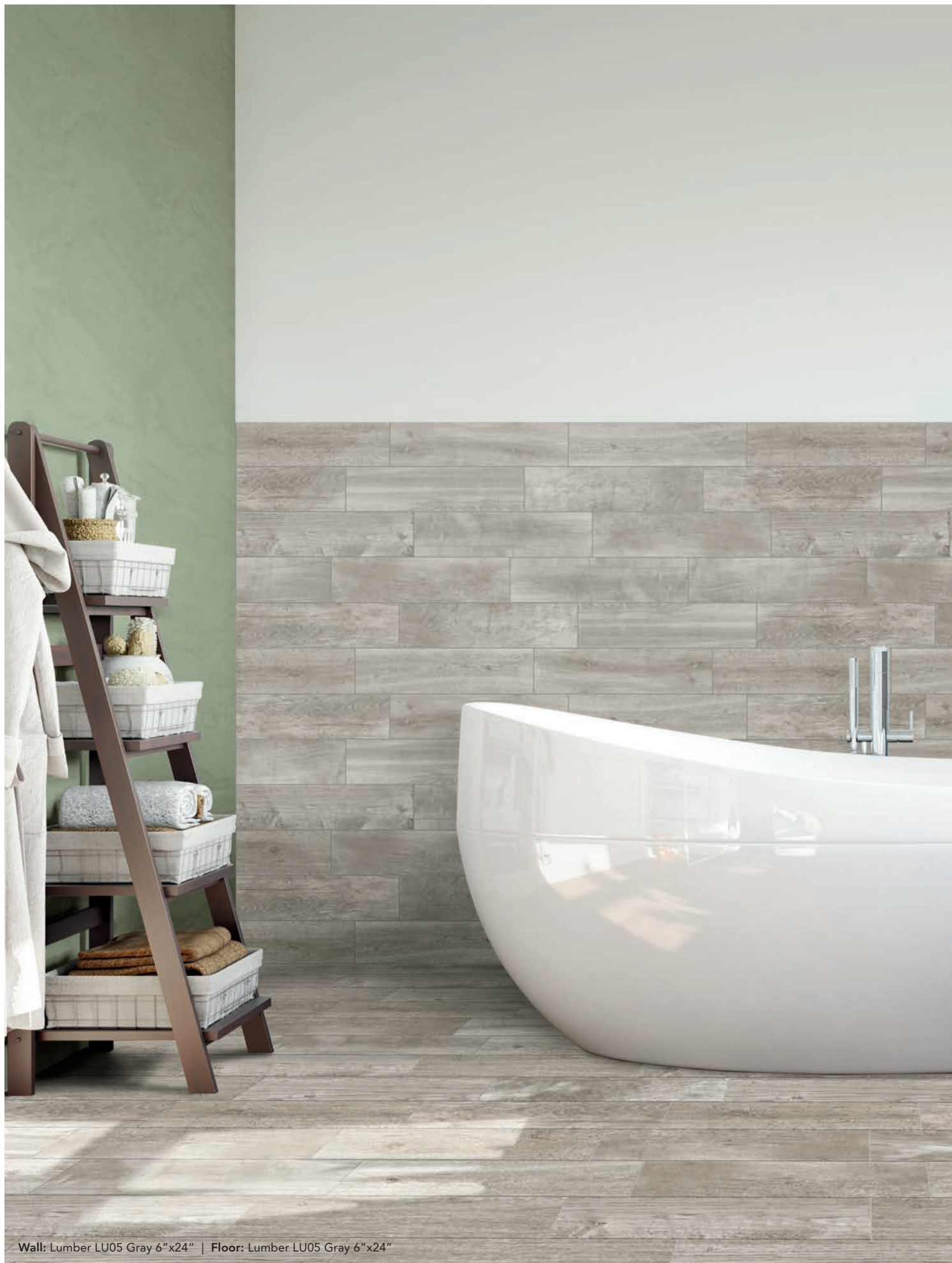
Wall: Lumber LU05 Gray 6"x24" | Floor: Lumber LU05 Gray 6"x24"