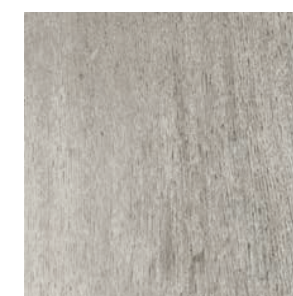
Lumber LU05 Gray