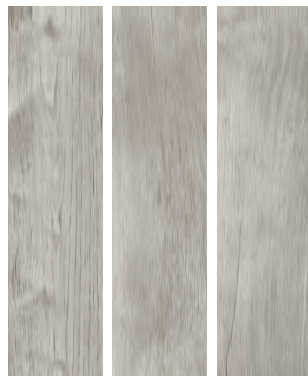
17LU05 Lumber LU05 Gray 6"x24" . 15x60 cm