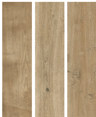
17LU03 Lumber LU03 Honey 6"x24" . 15x60 cm